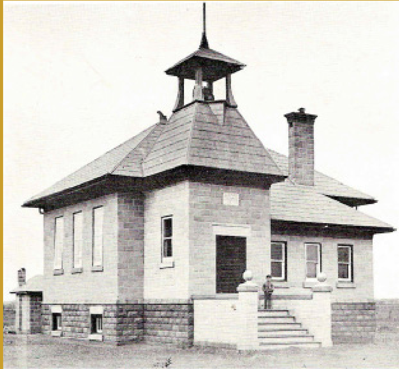
GONE, BUT NOT FORGOTTEN: In 1911, due to overcrowding and conditions of the original building, a new cement block school was built by Boyd Brothers where the Seniors Peace Park beside the village post office is today. This photo of S.S. No. 22 was taken shortly after the school was completed and was part of a series used by the Boyd company of Osgoode Village to sell its innovative building block. The school would be later destroyed by fire in 1944. The first school built in the village was literally a little red school house, built at 5516 Osgoode Main Street where Fagioni garments is located. Part of the little red school was moved to the old 237 village Main Street and continues to be used as a garage.